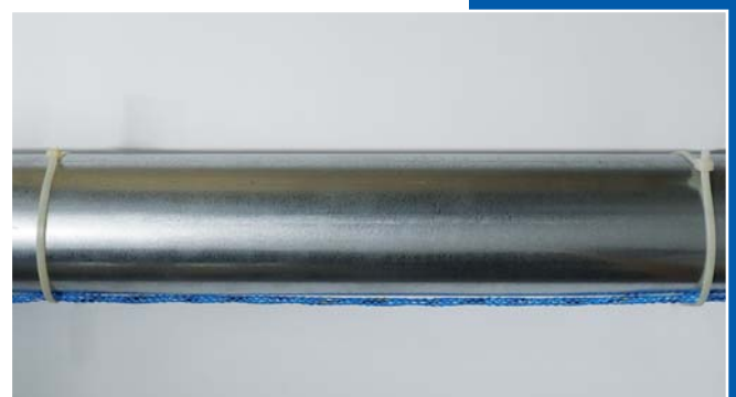
Installation on horizontal pipes