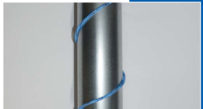
Installation on vertical pipes

LANCIER Monitoring GmbH Gustav-Stresemann-Weg 11 48155 Münster, Germany Tel. +49 (0) 251 674 999-0 Fax +49 (0) 251 674 999-99 mail@lancier-monitoring.de www.lancier-monitoring.de