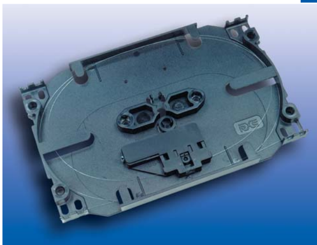
AquaSensor mounted in splicing box